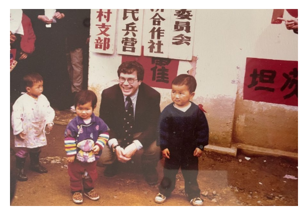
Fig. 5 The author with children in rural Anhui Province, China where hookworm infection was widely endemic. From Washington Post https://www.washingtonpost.com/archive/politics/1998/05/27/ chinas-new-hookworm-war/46bde149-087b-4692-b997-5b03e5d7f399/

collaborations with Fudan University in Shanghai. In parallel, I became interested in expanding the footprint of our Laboratory of Medical Helminthology because the Chinese Academy of Preventive Medicine (since renamed the Chinese CDC) had organized large-scale epidemiological studies conducted by parasitologists to find widespread parasitic infections among its population, especially hookworm and schistosomiasis across China's impoverished rural interior (Hotez et al. 1997) (Fig. 5). Although this situation was rapidly changing due to rapid economic development in Eastern China cities, the rural areas in the interior had been left behind and suffered greatly from parasitic infections (Hotez 2002).